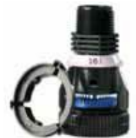
Shown with optional LEPA Bubbler Clip