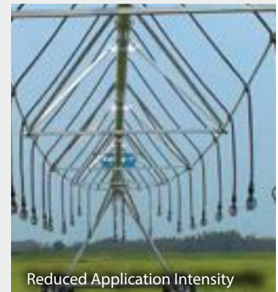
Reduced Application Intensity