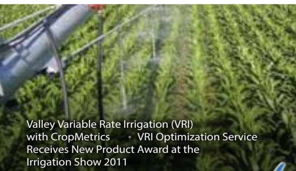
Valley Variable Rate Irrigation (VRI) with CropMetrics - VRI Optimization Service Receives New Product Award at the Irrigation Show 2011

Details: These are the industry's first VRI controls integrated directly into existing irrigation controls. In addition to helping to improve efficiency and lower production costs, the Valley VRI also includes the VRI Mapping program. This easy-to-use computer program allows a grower or operator to use soil texture, topography, Veris maps, yield maps or other specific field maps to develop irrigation prescriptions. Valley VRI comes in two variations. The VRI Zone Control allows maximum precision irrigation by individual sprinkler or span control through 30 different VRI zones along the spans, allowing up to 5400 zones throughout the entire field. This is controlled through Valley VRI tower boxes and the Valley Pro2 control panel at two-degree increments around the field. VRI Speed Control is the other variation and comes standard in new TouchPro, Pro2 and Select2 control panels and allows them to be programmed for variable rate control in two-degree segments.